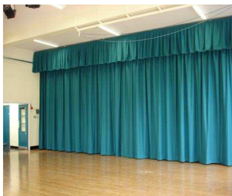
New curtains for the hall September 2008

Fund raising helps us to buy special resources for your children to enjoy!