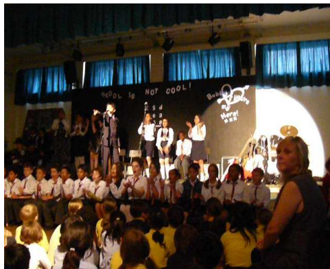
New stage lighting June 2009