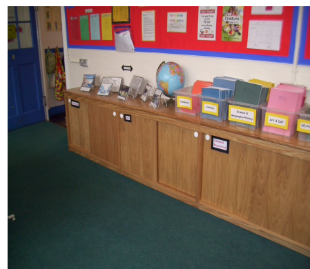
New carpets and furniture in classrooms September 2009