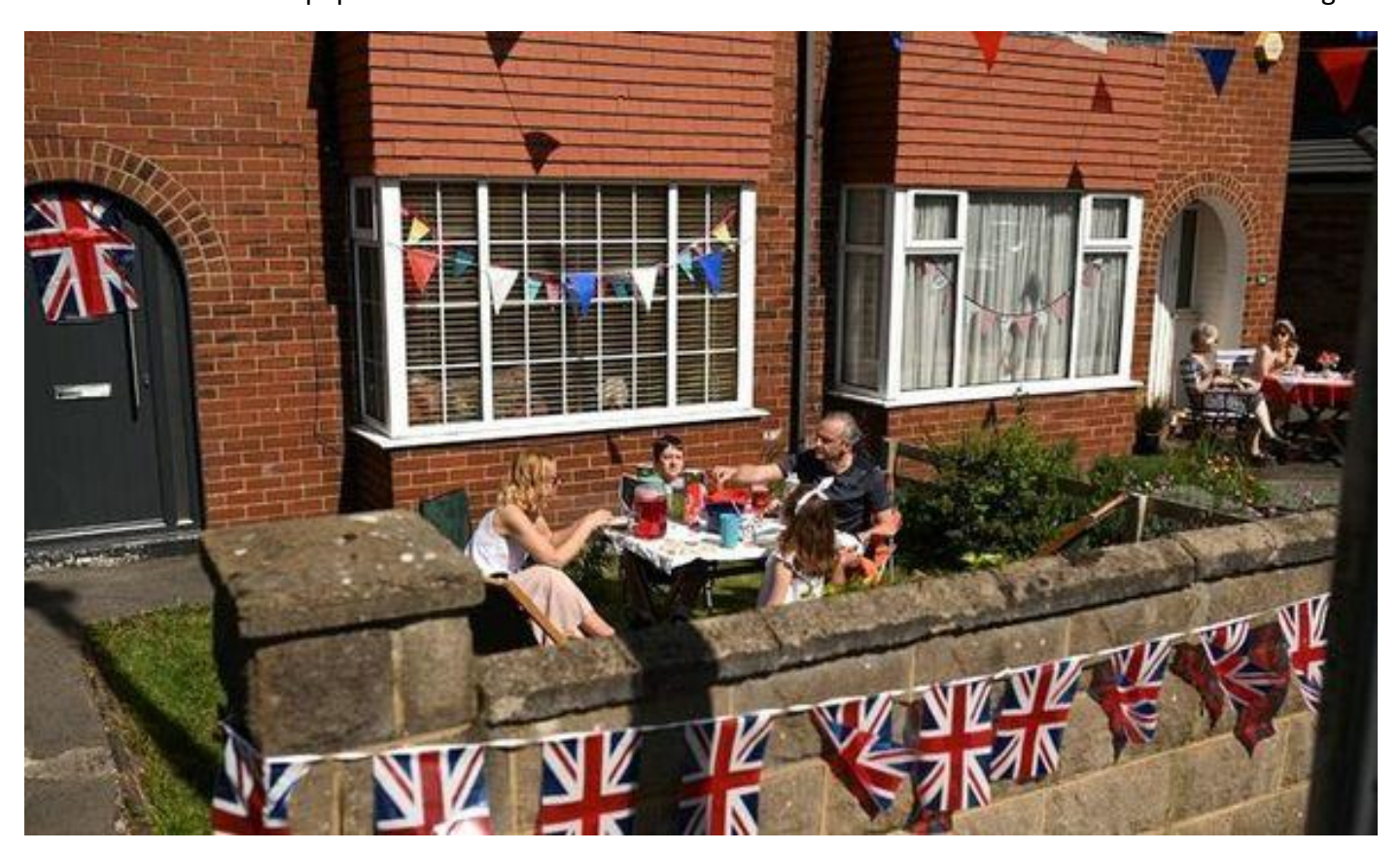
Task 2 – Use the newspaper fronted adverbial word bank below to write 6 sentences based on the image: